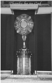
"Could you not watch one hour"