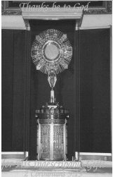
"Could you not watch one hour with Me?" Matt. 25:40